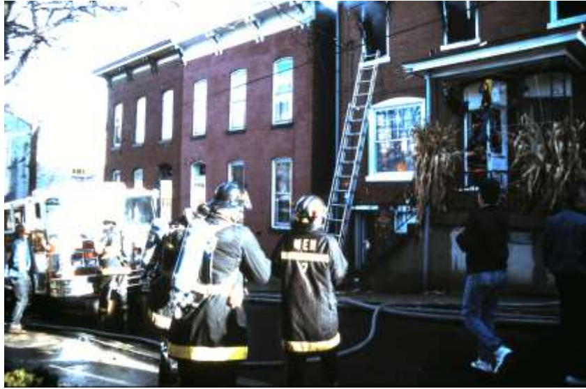
A general view of the scene after the bulk of the fire had been knocked-down.