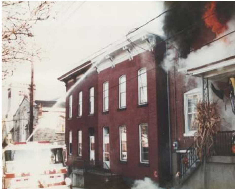
Good Intent firefighter and PFD photographer Bob Piccioni and Kevin Sibbett (American Hose) utilize the deck gun on Engine 11 – 1988 Hahn 1000 gpm pumper – to knock-down the second floor fire.

operated Engine 11's deck gun, Bob Piccioni transitioned back to PFD Photographer and snapped most of the pics below.