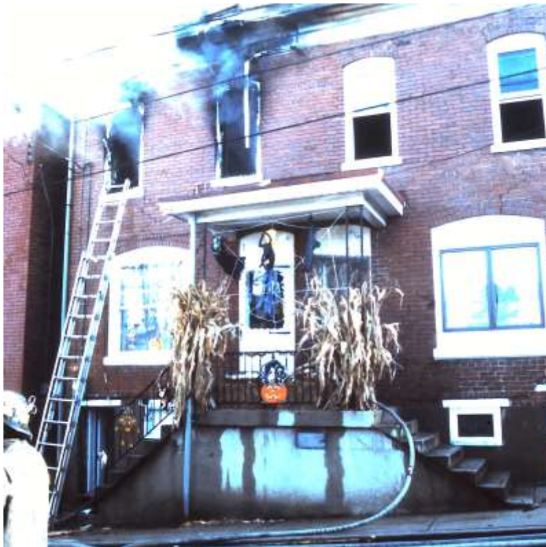
At first glance, this would have the appearance of two separate homes.