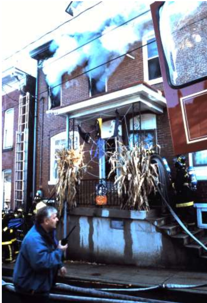
Hoselines are stretched and ladders are thrown as IC Gary Witmier (foreground) surveys the scene. Note the tiller cab sliding door of the Phoenix American LaFrance tractor-drawn aerial ladder truck in the upper right.